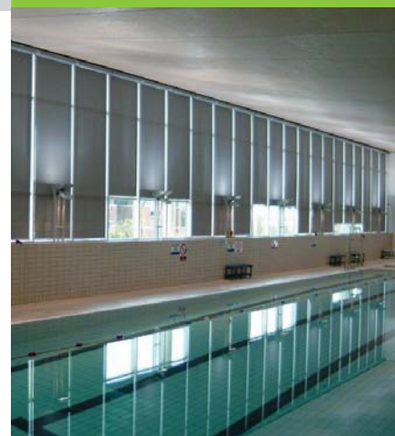
Thrapston Community Pool